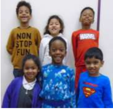
Year 1 & 2