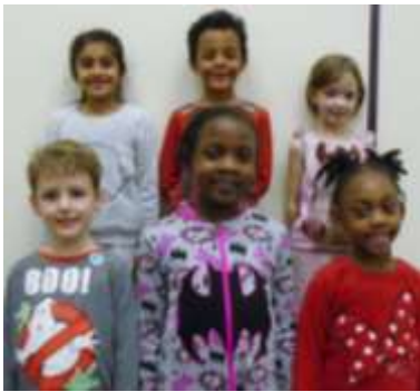
Year 1 & 2