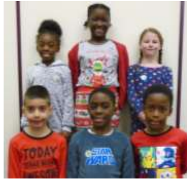
Year 3 & 4