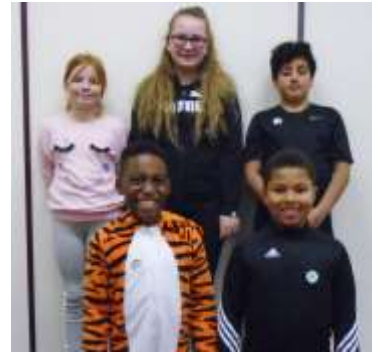
Year 5 & 6