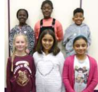
Year 5 & 6