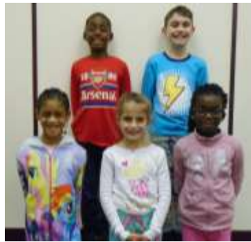
Year 3 & 4