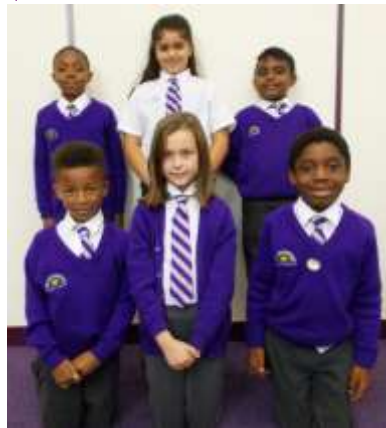
Year 3 & 4