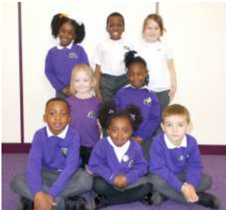
Reception, Year 1 & 2