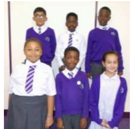
Year 5 & 6