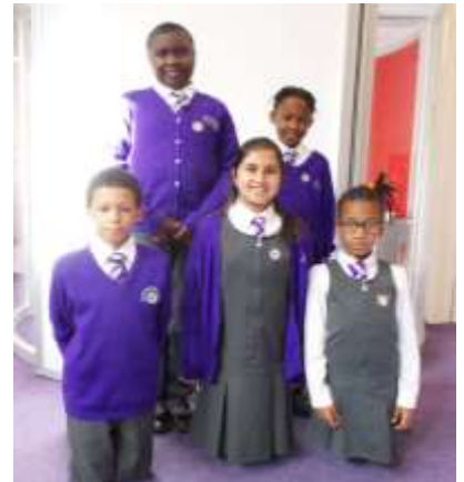
Year 5 & 6