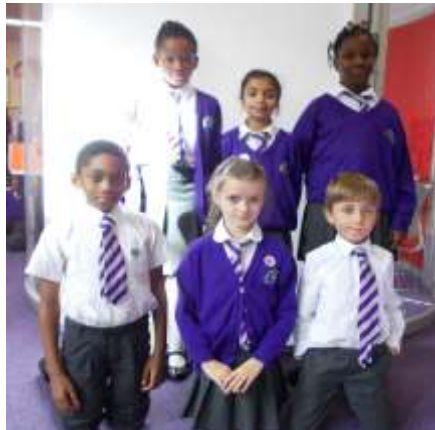
Year 3 & 4