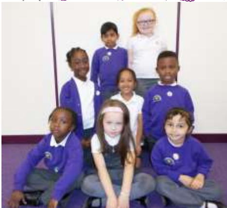
Reception Year 1 & 2