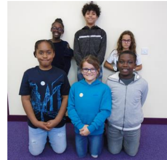
Year 5 & 6