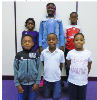
Year 3 & 4