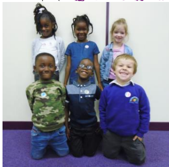
Year 1 & 2