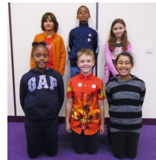
Year 5 & 6