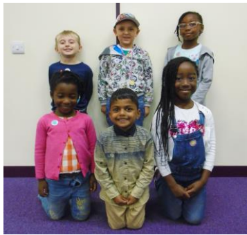
Year 1 & 2