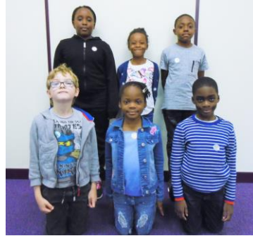
Year 3 & 4