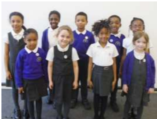
Reception, Year 1 & 2