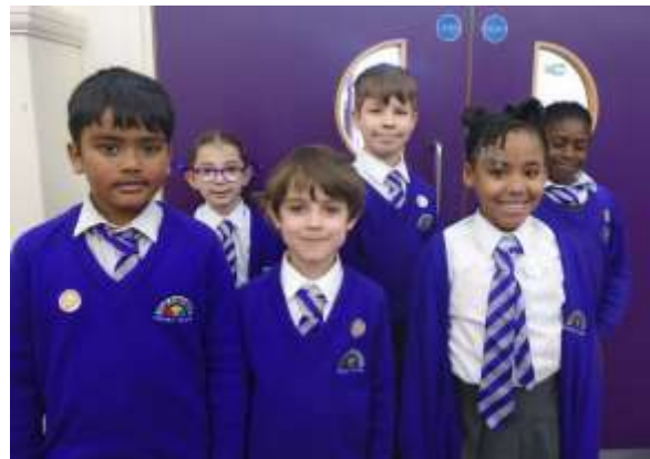
Year 3 & 4