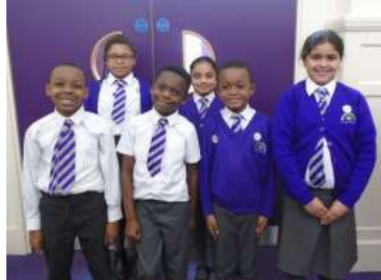
Year 3 & 4