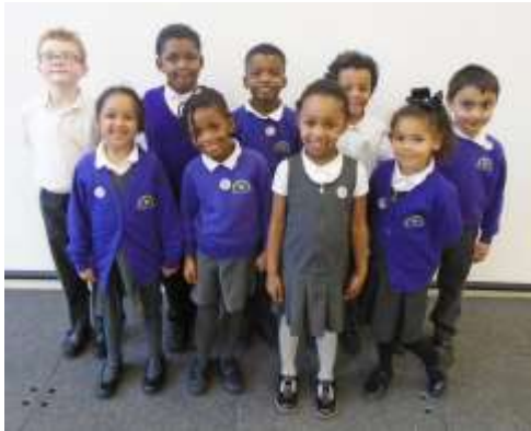
Reception, Year 1 & 2